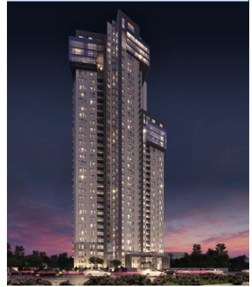
Columbia Aaltius, India

With a dedicated & strong presence, it didn't take us long to bag a prestigious high rise project "Columbia Aaltius", which is one of the tallest towers in a very premium locality of Bangalore called Electronic City. The structure will be executed with Mivan Aluminium formwork system.