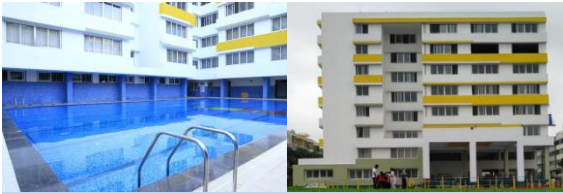
Vibgyor High School, India

TransAtlantic Infraprojects Pvt. Ltd. has marked its strong existence in the Construction biz of India. Within 2 years of initiating the Bangalore branch, it has grounded successful track record with the completion of 17,900 sq. mtr institutional project which consists of basement, ground and first floor. It was efficiently handed over in a span of 12 months.