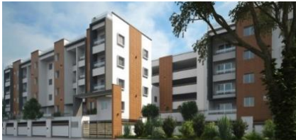
Esteem Ramaiah Apartments

The strategic plan to channel the team for tapping in institutional projects corresponding with residential / commercial verticals did give us enough confidence & proficiency to proceed successfully.